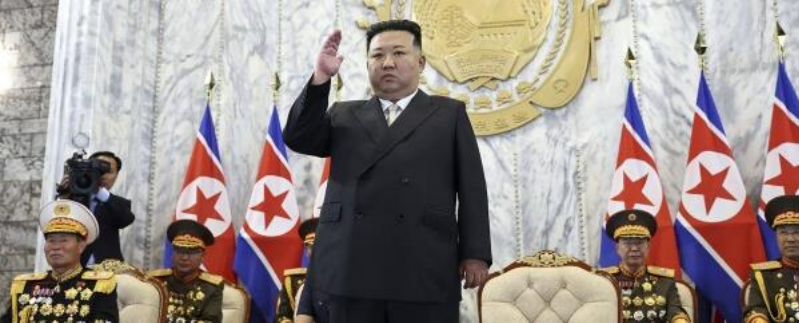
God's Rule over the Nations North Korean Supreme Leader Kim Jong Un